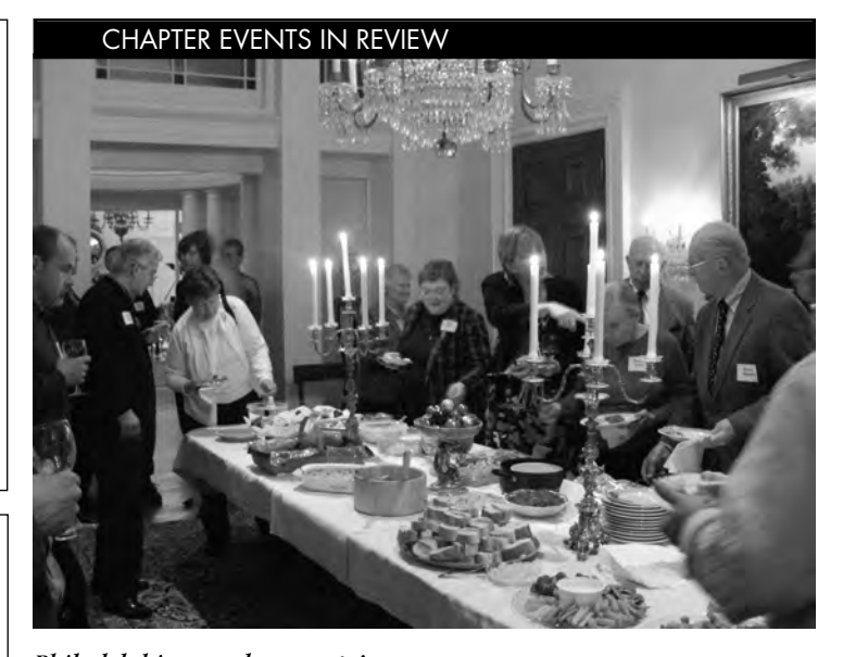
Philadelphia members party!

Quality New Instruments • Conscientious Electro-Pneumatic and Tracker Restorations • Consoles: New and Rebuilt • Tonal additions and realistic reconstructions • Prompt personal service